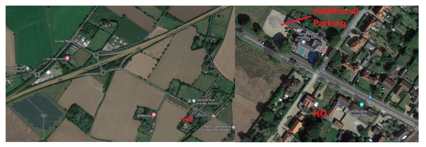
Route to Start: From HQ turn Left, at roundabout take 2^{nd} exit and cross over A11 at 2^{nd} roundabout take 1^{st} exit, at T junction turn Left onto B1172, at roundabout proceed on London Rd. continue through village to T junction were turn right and pass over A11 proceed on B1077 into Attleborough – proceed through traffic lights to turn right onto one-way system (caution) keep right follow road around tight bend proceed passed shops and keep left passed Garage, pass Lidl – At traffic light turn left to join Blackthorn Rd. and start area.